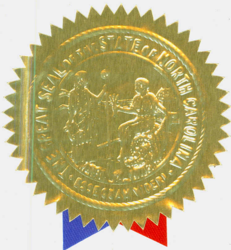
BEVERLY EAVES PERDUE

NOW, THEREFORE, I, BEVERLY EAVES PERDUE, Governor of the State of North Carolina, do hereby proclaim June 20-26, 2011, as "AMATEUR RADIO RECOGNITION AND APPRECIATION WEEK" in North Carolina, and commend its observance.